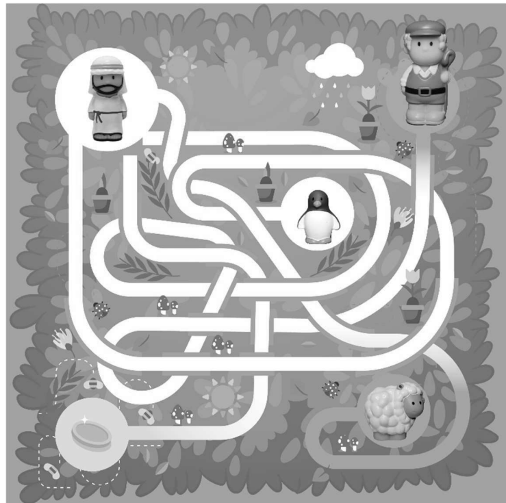
Illustration by Jessica Littlewood